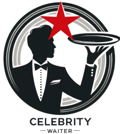
TABLE THEMES AND CHALLENGES

To elevate your Celebrity Waiter experience here are a few ideas for your themed tables that add fun, friendly competition. Along with an opportunities for additional fundraising through challenges and tip incentives!